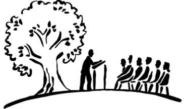
Outdoor Worship Service

We will celebrate worship outdoors on the church grounds , followed by an intergenerational Sunday School program, and then a picnic lunch. We need your help to make this happen! Please let us know how you can help: